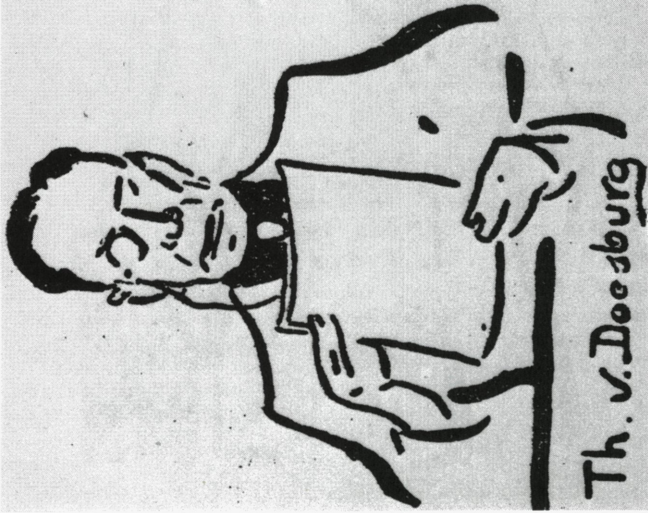
Th. v. Doesburg